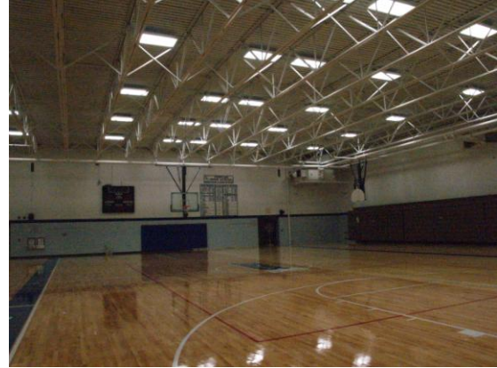
The renovated gym with drop ceiling and closets removed.