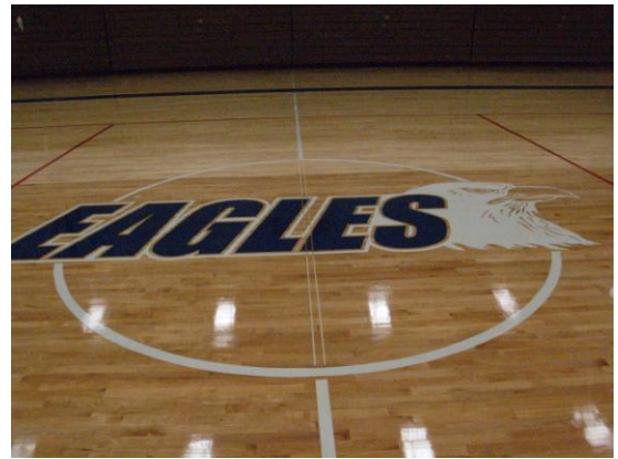
The new center court graphic.